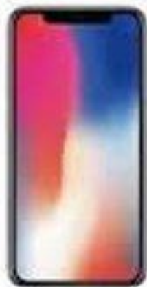
i phone X