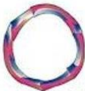
i phone (x-h)^2 + (y-k)^2 = r^2