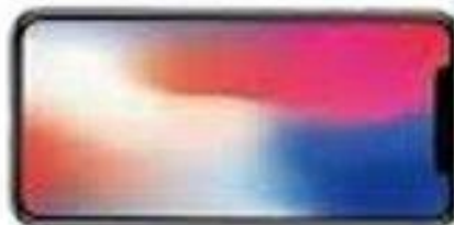
i phone Y